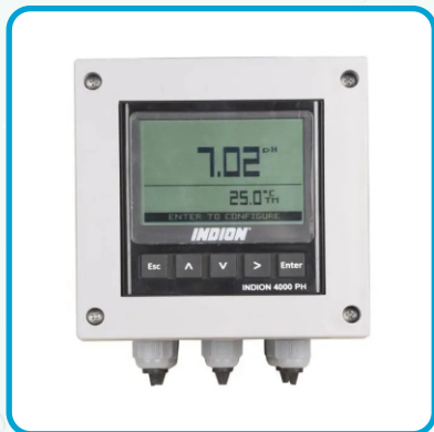
INDION Online Controllers & Transmitters

They are available in models to suit every environment – handheld/portable, benchtop, wall/field mounted, panel and rack mounted.