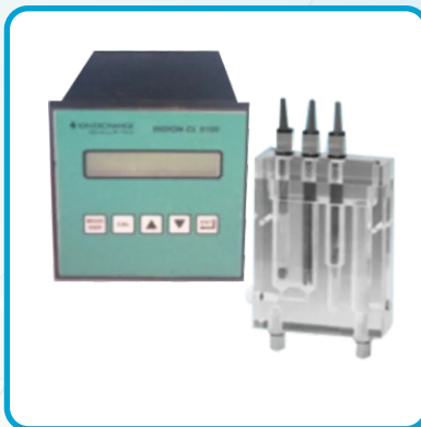
INDION Water Quality Monitoring Instruments