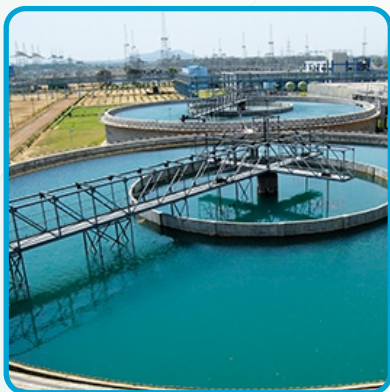
RAW WATER TREATMENT