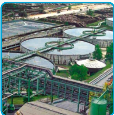
WASTE WATER SYSTEMS

They are designed for the recovery and reuse of water and products, such as Water from power plant, fertilizer, electronics, electroplating, textile, chemical, food & beverage, pulp & paper, pharmaceuticals and automobile industries.