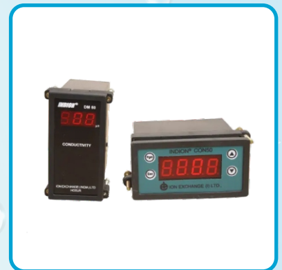
INDION Water Quality Measuring Indicators