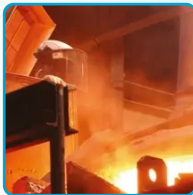
INDION® Fireside Treatment