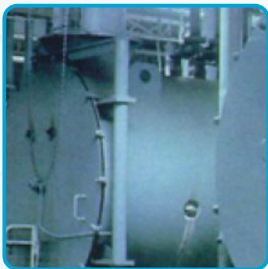
INDION® Boiler Water Treatment

Our INDION® Specialty Water Treatment Programme includes cooling water treatment, boiler water treatment, fireside treatment, coagulants, flocculants, antiscalants, membrane cleaning chemicals and water testing kits. We also offer a range of INDION® speciality chemicals for sugar, paper, petro-refinery, mining and other processes.