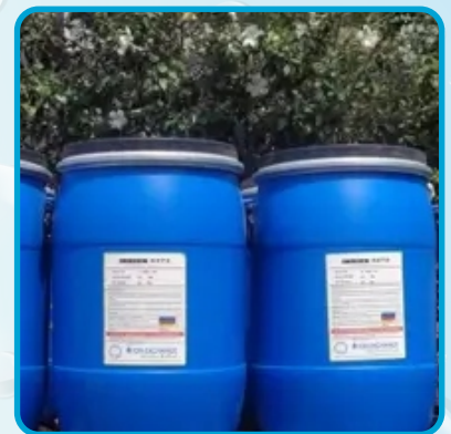
Antiscalants & Membrane Cleaning Chemicals