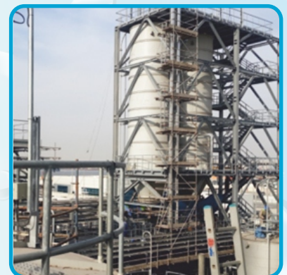
ZERO LIQUID DISCHARGE (ZLD)