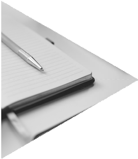
World Class Model