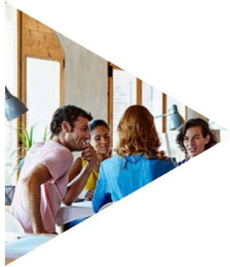
Enterprise class Experience