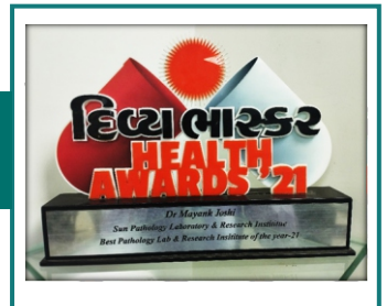
Best Pathology Lab