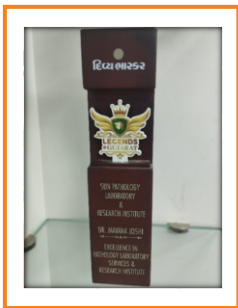
Legends Of Gujarat