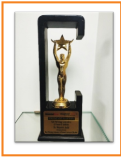
Pride Of Nation